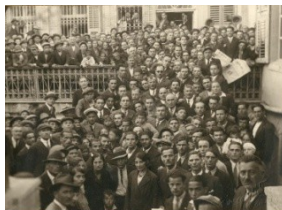
Contemporary Social History Archives (ASKI)